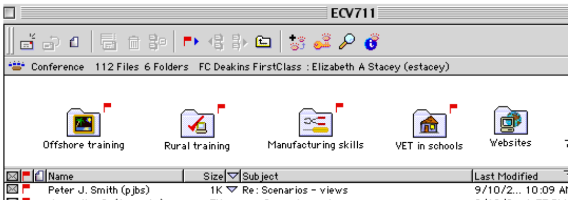
Figure 1: First Class General Space and Discussion Structure for Unit A

In Unit A student participation in the CMC discussion was strongly encouraged, but was not compulsory, and participation had no direct impact on assessment. Participation was not made compulsory on a basis that CMC skills were not part of the learning outcomes of the Unit, and the student cohort varied in their degree of access to the CMC discussions.